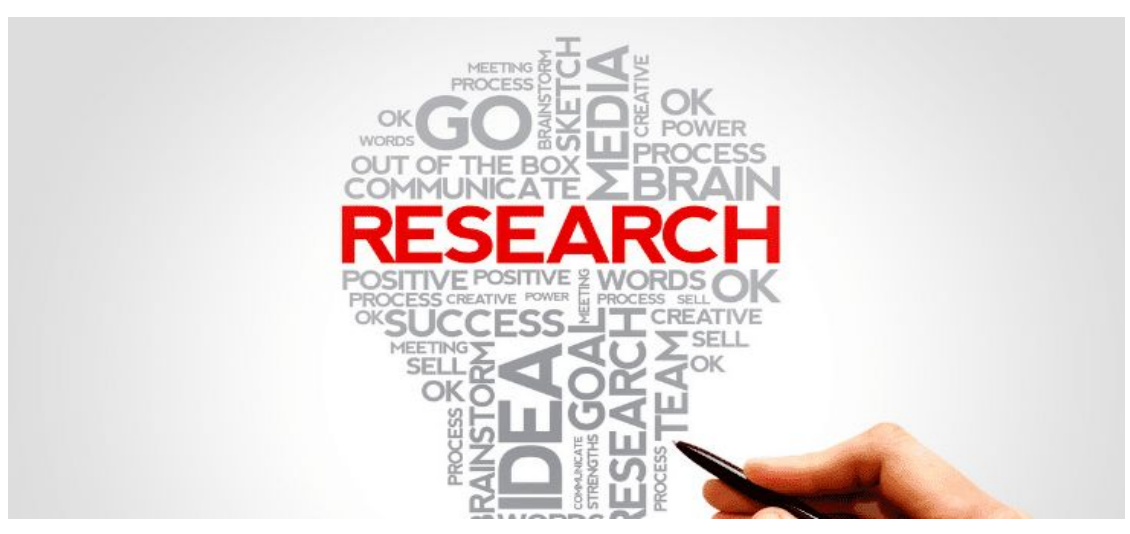
DiscoverPhDs (2020) via <a href="https://www.discoverphds.com">https://www.discoverphds.com</a>

What are the perspectives of two bilingual students of Mexican heritage about their educational experiences in Spanish in a bilingual community on the Central Coast of California?