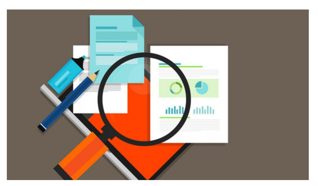
Via <a href="https://www.enago.com/es/">https://www.enago.com/es/</a>